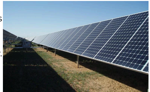
Solar PV park. Author: mdreyano. License: Creative Commons, Attribution 2.0 Generic.

Emerging Power Inc (EPI) plans to invest in the construction of both solar and wind parks in the Philippines' Subic Special Economic Zone after purchasing a controlling stake in the project developer, local media said Friday.